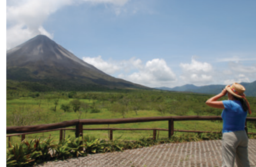
Arenal Volcano, Day 5-6

TAILOR-MADE SERVICE: Please enquire for a personalised itinerary to fulfil your individual requirements. We can combine hotels, change route, excursions and we can offer triple rooms, suites and De Luxe Hotels.