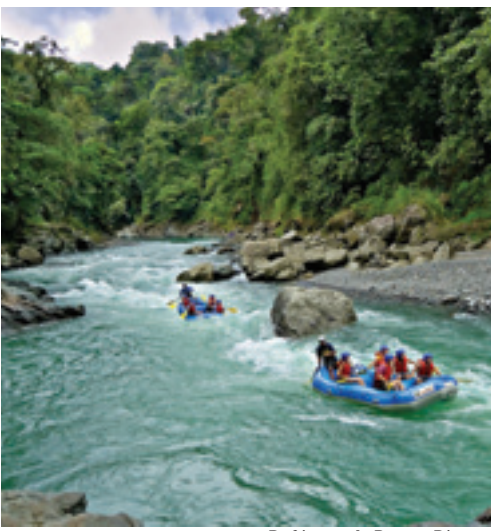
Rafting on the Pacuare River

Day 14 Return to San José by road, spend one final night, and fly home the next day arriving Day 16. (B)