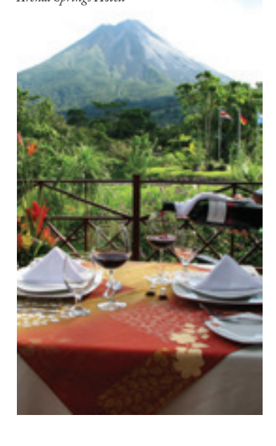
Arenal Springs Hotell

Arenal Springs Resort is the ideal combination of modern comfort and exuberant tropical surroundings. The rooms are all in semi-detached bungalows spread over a wide area directly facing Arenal Volcano. Each room has a patio with seating, as well as air conditioning. The hotel also has its own hot springs, which feed into a number of hot tubs and pools of different temperatures, all of which guests can enjoy at their leisure. There is also a spa, a yoga studio, and two restaurants.