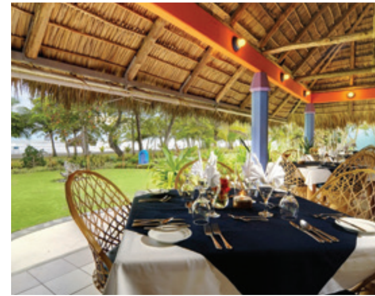
Alma del Pacifico Hotel

Situated on Costa Rica's Pacific Coast just 2 hours drive from San Jose Airport, Alma del Pacifico is a small hotel made up of 20 colourful villas set among lush tropical gardens, connected by paved walkways and fronting onto a wide sandy beach. The spacious and comfortable rooms are full of vibrant works of art, and each one has a large private terrace with outdoor seating. Many of the rooms are ocean facing, with terraces that look straight onto the beach, while others face into the garden with just a short walk to the sea shore.