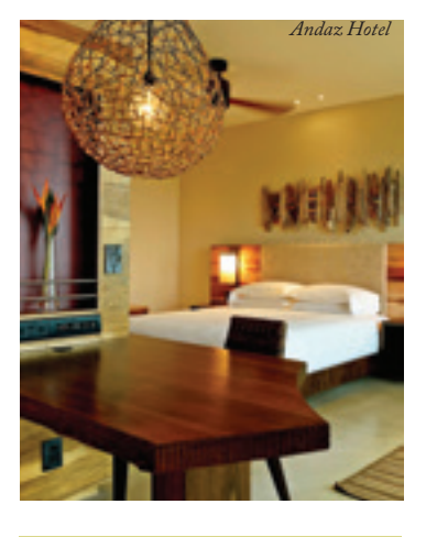
Additional Hotels: Four Seasons, Capitan Suizo, Occidental Gran Papagayo, Allegro Papagayo

Situated in a quiet residential area surrounded by trees, just outside the town of Tamarindo, Calla Luna Hotel and Villas offers upmarket boutique accommodation in a secluded setting. The hotel is made up of bungalows scattered among lush tropical gardens, each containing two rooms, some of which have communicating doors. Each room has air conditioning, private facilities, and a private terrace. The hotel has a swimming pool, a restaurant