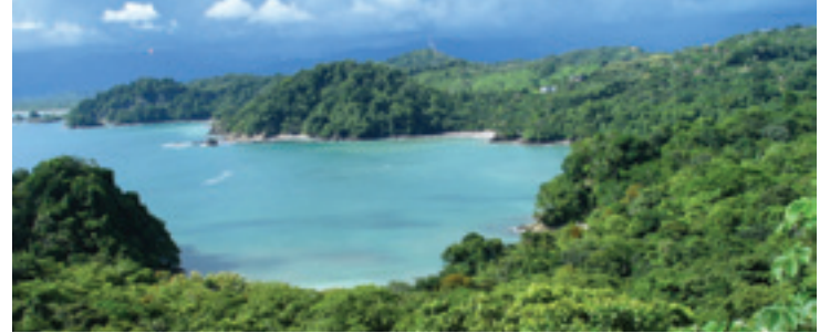
Manuel Antonio National Park