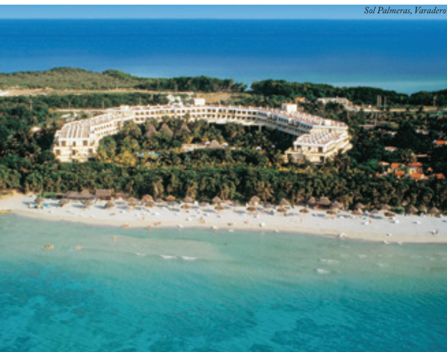
Sol Palmeras, Varadero

Varadero is a peninsula two hours from Havana, lined with long beaches and a number of large all-inclusive hotels managed by international groups, offering the usual cocktail of watersports and beach activities. There is no feel of being in Cuba but the sea is clear and warm and the sand soft and white, ideal for a beach resort. There is also a nearby park and nature reserve.