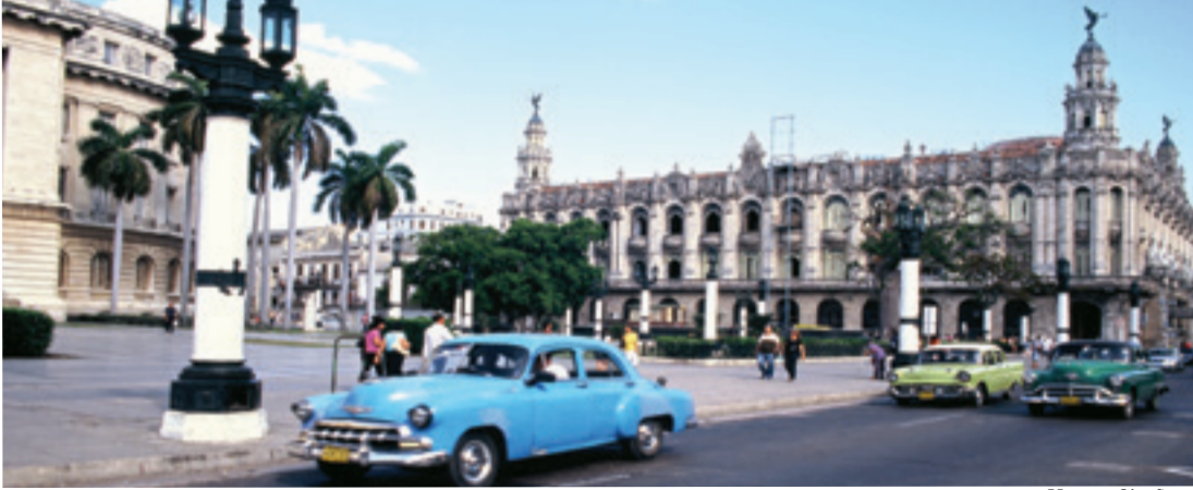
Havana City Street