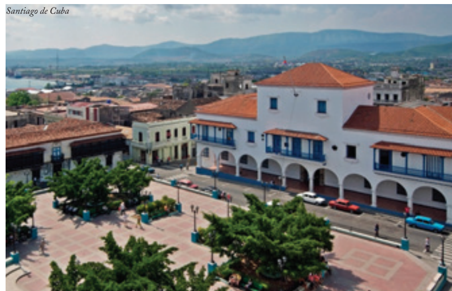
Santiago de Cuba

Santiago is Cuba's second largest City but relatively small; it has long been Havana's rival for literature, music and politics, being the "Cradle of Fidel's Revolution". The city has a lively and cosmopolitan mix of Afro-Caribbean flavours, ideal to walk the narrow streets, admire the colonial architecture and hustle and bustle of daily life on the main square. Music and dance are a fundamental part of local culture. There are modern hotels and small guest houses to use as a base to explore this fascinating city.