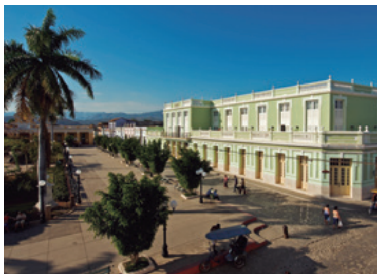
Main Square, Trinidad

Trinidad is a historic colonial city, World Heritage Site, of Spanish Colonial Architecture with cobbled streets, magnificent mansions with Carrara marble floors. Visit the Baroque churches and museums, or explore the surrounding Escambray mountains. Time here has stood still and the pace of life is slow. There are restaurants and cafes with outdoor tables and a lively nightlife with salsa music and dancing.