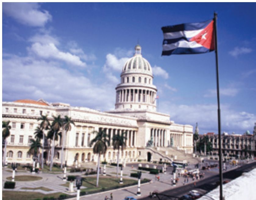
Capitol Building, Havana