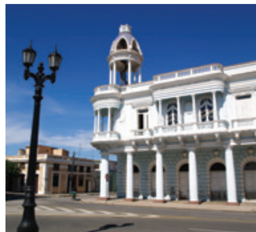
Colonial Architecture in Cienfuegos

Day 4 Visit Che Guevara's mausoleum on the way to Havana or Varadero beach.