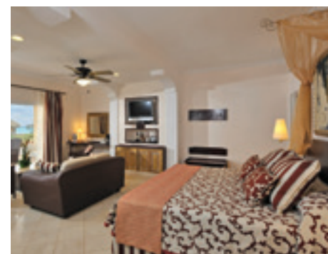
Room at Paradisus Varadero

The hotel is spacious and decorated in a good style (unlike many others), aiming for the highest standards of luxury in Cuba, although Cuban cuisine can be considered a bit bland. All meals, drinks, snacks, entertainment and activities are included. The rooms have views of the bay or the exotic tropical gardens. The Garden Villas have private pools for those who prefer privacy. The white sand and clear waters make this an ideal place to relax, sunbathe or enjoy watersports.