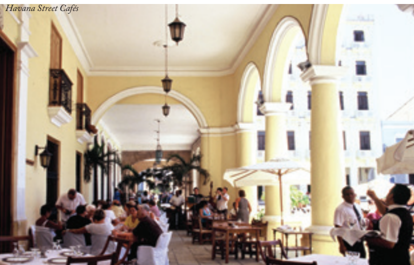
Havana Street Cafés