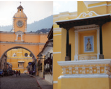
Casa Encantada First