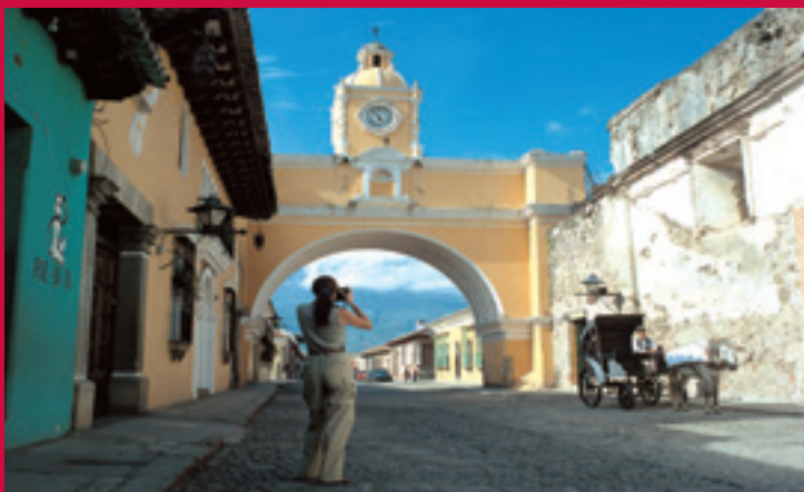
Antigua preserves its traditional, colourful buildings

Jungle lodge - 1 night • Tikal - 2 nights • Antigua - 2 nights