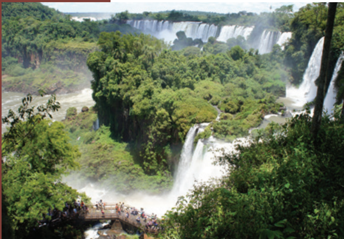
Iguazú Falls, Days 5-6

Enjoy the European feel of Buenos Aires and tango music. Admire one of Nature's breath taking creations at Iguassu Falls. Experience the unique seaside setting of Rio and the historic Salvador da Bahia