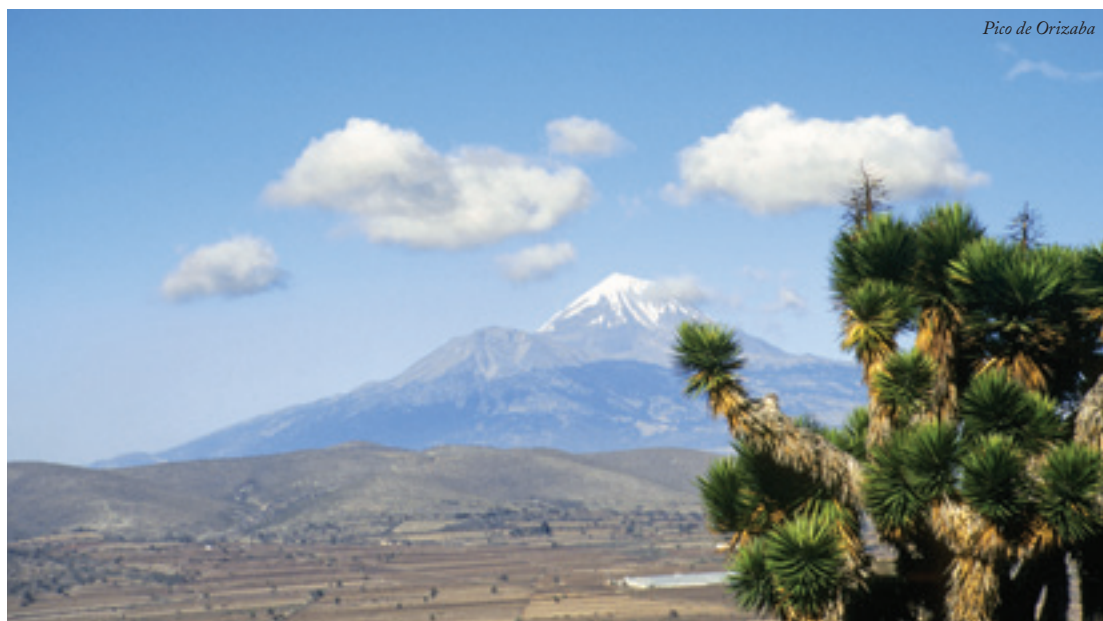
Pico de Orizaba

Journey overland from Mexico City to the Caribbean coast to peel back the layers of Mexico's ancient civilisations and colonial heritage, from the Toltecs and Aztecs of Central Mexico, the Zapotecs and Mixtecs of Oaxaca, to the Mayan pyramids of the Yucatán Peninsula and the more recent influences of the Conquistadores.