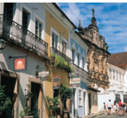
Salvador da Bahia, Days 11-14