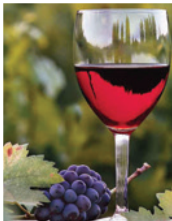
Mendoza & Santa Cruz, Days 4-5, 8

Days 9-11 We continue south for a full day on the bus to the picturesque town of Pucón, where we stay for three nights to relax and enjoy the Chilean Lake District. Pucón is situated on the shore of lake Villarica, at the foot of a snow-capped volcano and surrounded by temperate