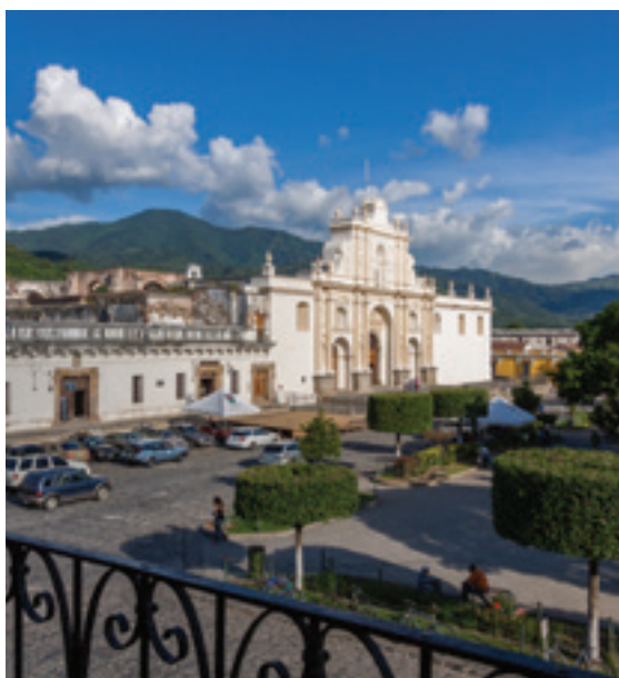
Antigua, Days 2 and 7