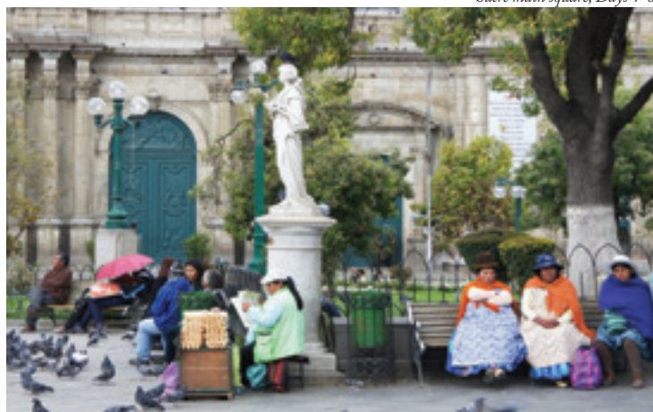
Sucre main square, Days 4-6

Days 1-3 Depart London on an overnight flight to Santa Cruz in Bolivia, a wealthy town in the lowlands. We stay for two nights in a hotel with gardens and a pool. Next day we tour the city. (B)