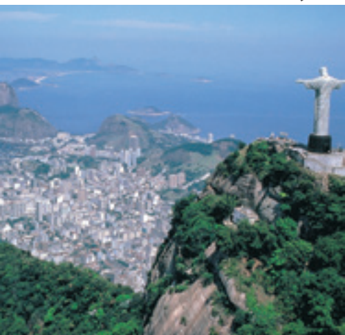
Rio de Janeiro, Days 7-10

Days 1-4 Departure flight overnight to Buenos Aires staying for three nights. Meet your Tour Leader and the group. The hotel has spacious rooms with private facilities and is centrally located in Barrio Norte, an elegant residential district. Tour the city's famous sights as well as explore "behind the scenes", the local way of life. (B)