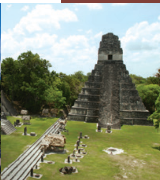
Tikal, Days 9-10

The Mayan Civilisation declined before the arrival of the Conquistadores. Today, we visit their legacy, massive pyramids and jungle strongholds, colourful markets and colonial heritage; with the option of staying on the beach at the Belize Barrier Reef.