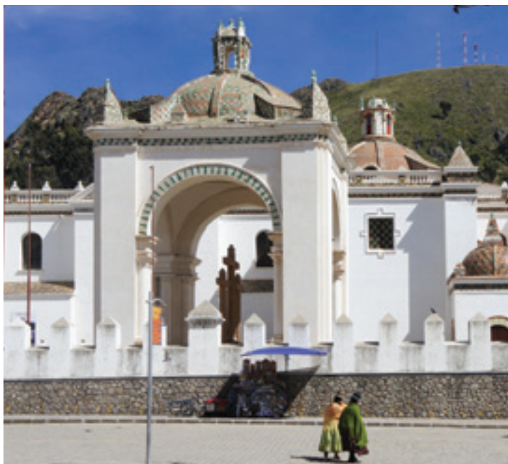
Copacabana church, Day 10

Landlocked and steeped in history, Bolivia is the heartland of a unique culture, where people proudly maintain and value their traditions. Major Inca stone archaeological sites and heritage are surrounded by imposing mountain peaks and ancient cities.