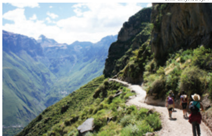
Colca Canyon, Days 4-6

Full day by day detailed description on: