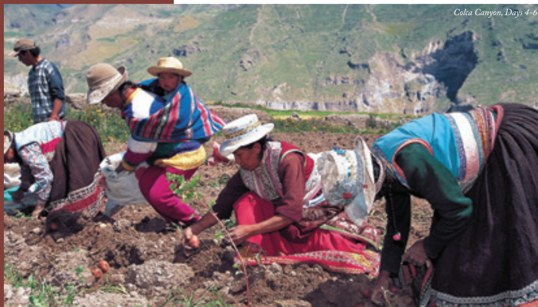
Colca Canyon, Days 4-6

Days 4-5 We make an early start today to travel by road to the Colca Canyon, where we stay for 2 nights. Carved out of the landscape by the Colca river it is the world's deepest canyon, and is still inhabited by traditional communities who farm on pre-Inca terraces either side of