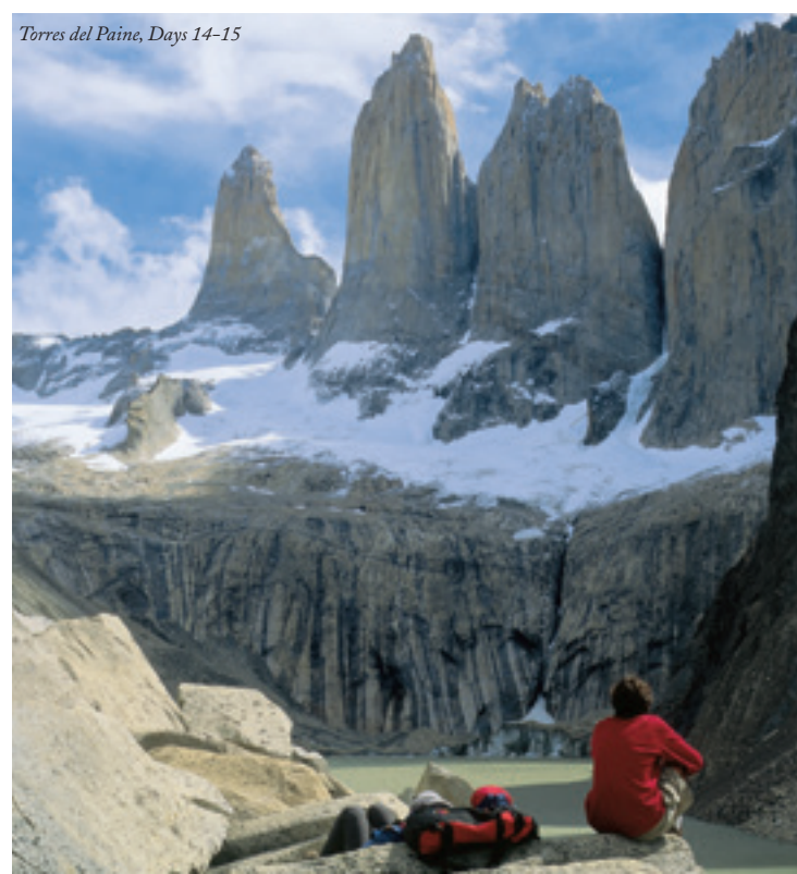
Torres del Paine, Days 14-15

Days 1-3 Evening departure on the overnight flight to Buenos Aires , the Paris of the South, arriving in the morning. We meet our Tour Leader and have a group briefing before taking the afternoon to rest or explore the city. Staying for 2 nights we take a full day tour of Buenos Aires, including the colourful neighbourhoods of La Boca and Recoleta, an area filled with beautiful European-style buildings and visit sites of historical interest. (B)