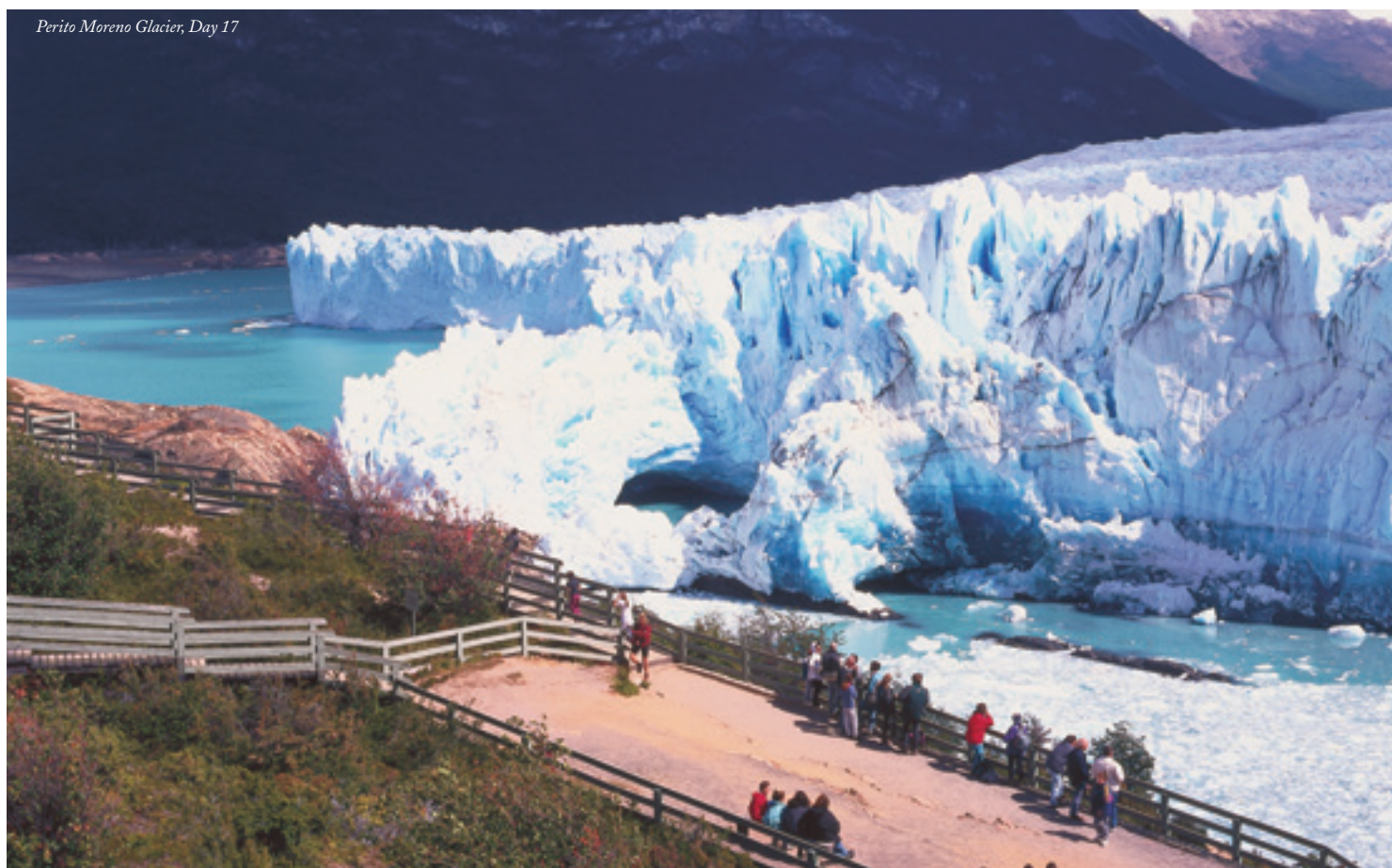
Perito Moreno Glacier, Day 17

of Santa Cruz, passing through Chile's central wine valleys with the imposing Andes mountains always visible to the east. We stroll around the picturesque town in the afternoon or visit one of the famous local wineries. (B)