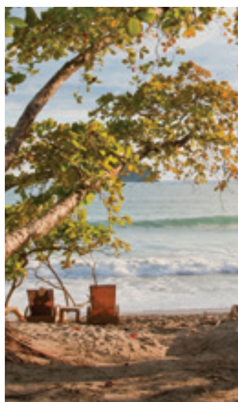
Beach at Manuel Antonio

Stay on longer to visit Corcovado National Park on the Osa Peninsula, or Rincon de la Vieja. Alternatively, enjoy one of the beach resorts on the Pacific. Please contact us and refer to pages 172 to 179 for more extensions to your trip.