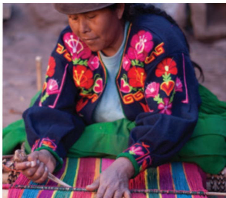
Machu Picchu, Days 14 - 15