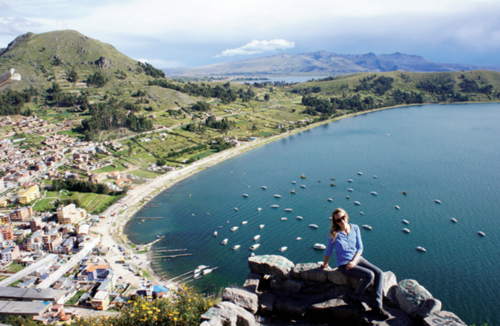
On the shores of Lake Titicaca, Days 10 - 11

llamas. We have breakfast and lunch on the train as the mountain scenery unfolds. On arrival we are taken to the Urubamba Valley, known as the “Sacred Valley of the Incas”, with archaeological sites, small villages and fertile terraces producing quinoa, cereals and numerous varieties of potatoes. (B,L)