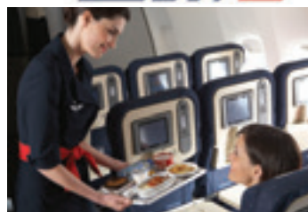
Air France Economy Cabin

38" seat pitch, reclines to a position of 123° and 1m between rows. Priority check-in desk and extra baggage allowance.