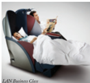
LAN Business Class