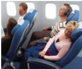
Above: World Traveller Plus