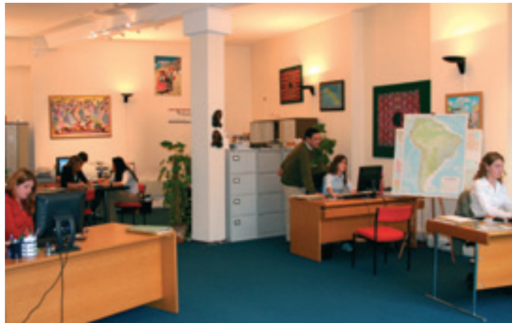
Our main office in London. You are welcome to visit us, please refer to page 193 for directions