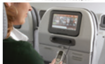
Tap Air Portugal Economy Cabin

Virgin Atlantic departs from London Gatwick to Havana and Cancún. Aircraft offer Economy Cabin seats with 31" pitch, Premium Economy with 21" width and 38" pitch. Upper Class with fully flat beds, 82" in length and 33" in width.