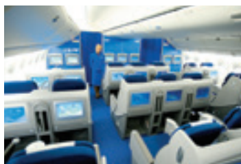
KLM Premium Business Cabin

Seats recline to a fully flat bed 23" wide by 73" long. Each seat includes a TV screen and audio-video system. Choice of three course meals and bar.