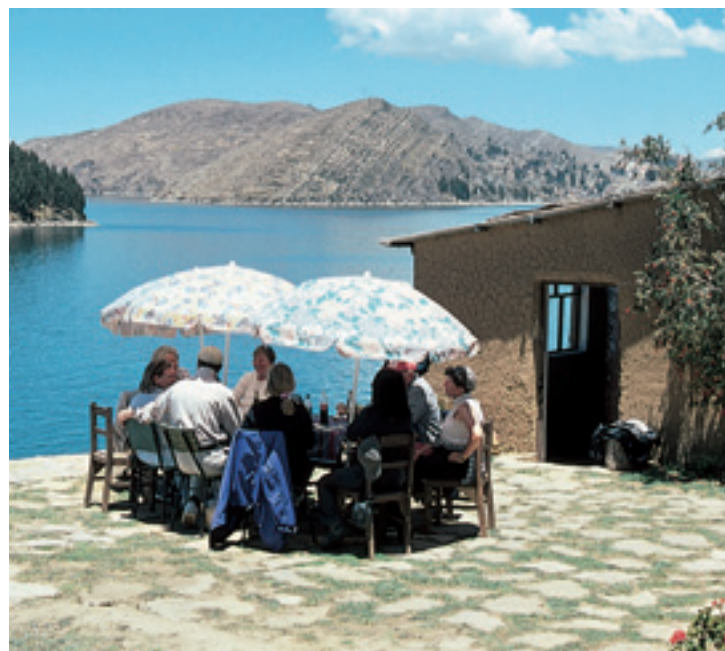
Clients on our Group Tour having lunch overlooking Lake Titicaca (Sun Island, Bolivia)