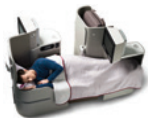
Iberia Business Plus Seat

With the majority of the fleet renovated in 2015, Iberia has the most extensive network of flights from Europe to Latin America: Mexico City, San José, Guatemala City, Managua & Panamá City, Lima, Quito, Caracas, Bogotá, Santiago, Buenos Aires, Montevideo and Rio de Janeiro. Departing from London Heathrow (Manchester and London Gatwick on certain days) via Madrid with direct non-stop onward flights either daytime or overnight. Regional connections also available via London.