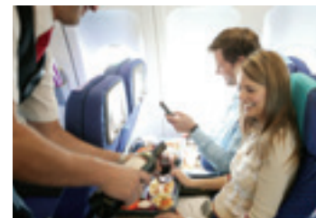
Lan Economy Cabin

TAM is the Brazilian national carrier, and has daily direct, non-stop flights to São Paulo (overnight), as well as internal connections throughout Brazil.