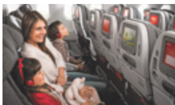
Avianca Economy Cabin Seat

The Economy Cabin has a 31" seat pitch, choice of meals on the long haul flights, but paid service from London to Madrid. Veloso Tours staff have flown with Air Europa frequently and found them to be both comfortable and punctual, and offer very reasonable prices.