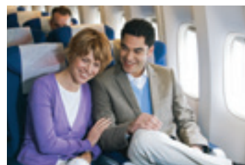
KLM Economy Cabin

Manchester, Leeds Bradford, Bristol, Edinburgh, Birmingham, Southampton, London City & Heathrow, Newcastle, Glasgow, Exeter, Aberdeen, Norwich, Belfast, Cardiff and the Isle of Man.