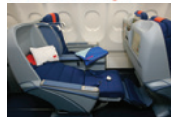
AirEuropa Business Cabin Seat

Stylish seats convert to flat beds with a mattress, and have a wide tray table and bench to enjoy the meal with a friend. Personal interactive video screen and luxury toiletries. Dedicated check-in desk and access to Business Lounge.