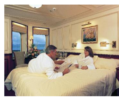
Please contact us for dates of departure, prices and itineraries.