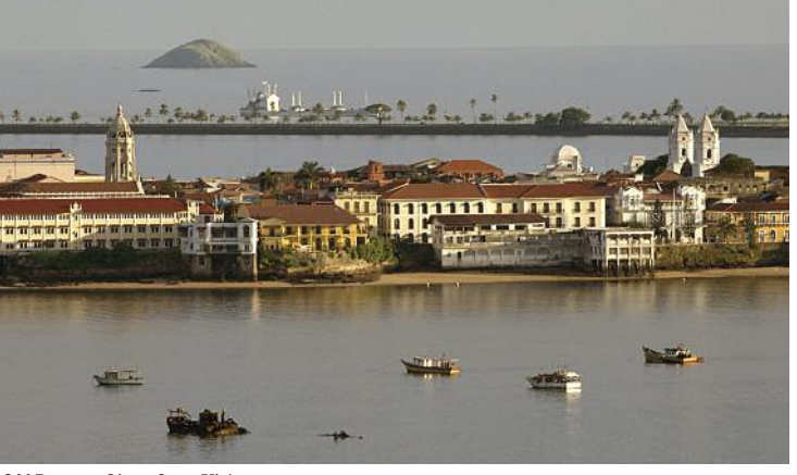
Old Panama City - Casco Viejo

Visit the famous Panama Canal and observe the working of the locks either by taking a boat on the canal or visiting the museum at Miraflores lock and having lunch in the restaurant with a wonderful panoramic view of the movement of ships. Visit the pristine rainforest and lakes that store the water for the locks and surround the canal. Visit Panama City and take in the magnificent hilltop views of the bay, the modern city and the old colonial