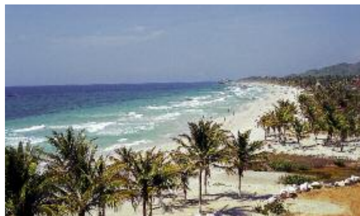
Margarita Island - Playa el Agua

TAILOR-MADE SERVICE: Please enquire for a personalised itinerary to fulfil your individual requirements. We can combine Tourist class hotels with private transfers and excursions and we can offer De Luxe Hotels.