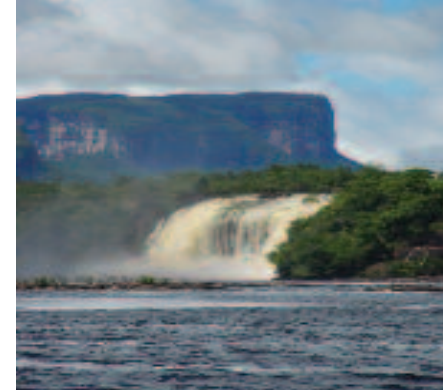
Canaima National Park