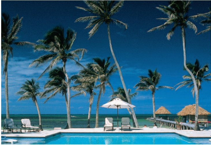
The swimming pool by the sea at Victoria House Hotel

Located on the Caribbean coast of Central America, Belize is home to the largest barrier reef in the Western Hemisphere and a truly magical marine environment with excellent resorts on the cayes. The ancient Mayan civilisations thrived in Belize for centuries, their towering monuments mysteriously hidden in the dense tropical rainforest of the rugged interior.