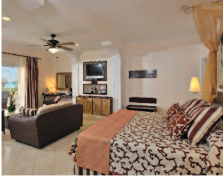
Room at Paradisus Varadere

The hotel has 408 rooms in its horseshoe shaped main building, plus 200 more isolated bungalows set among the gardens. The small beach is separated from the hotel by a band of trees, hiding it from view but giving it a natural feel. Suitable for families, there is a central swimming pool, tennis courts and access to a golf course.