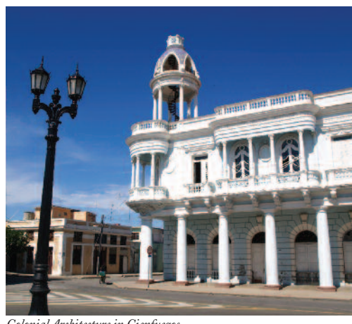
Colonial Architecture in Cienfuego

This quiet provincial town was once an important port, a trading route and agricultural centre surrounded by fertile fields and plantations. Visit the castle of Jagua at the entrace of the bay, the Cathedral, the Jose Marti Park in the Plaza de Armas, the botanic gardens and the provincial musuem. The city is listed on the UNESCO World Heritage list and close to the Bay of Pigs, site of the Cold War-era failed invasion.