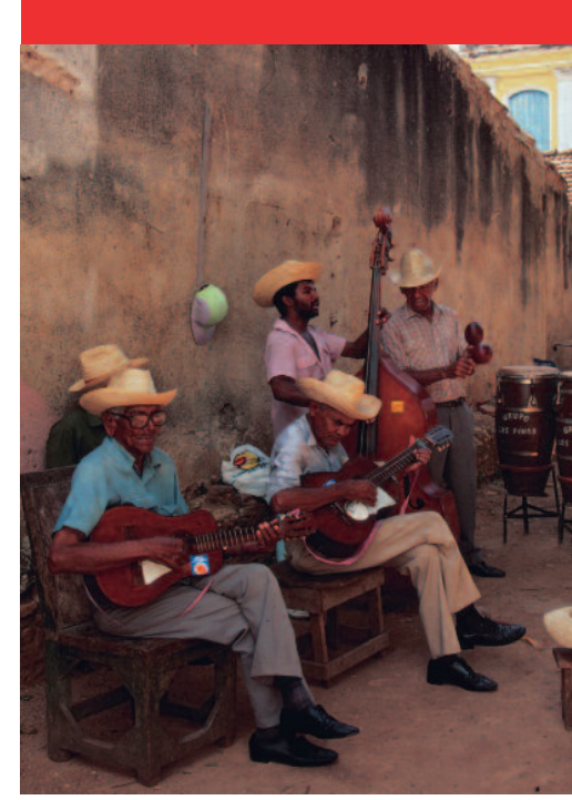
Traditional Cuban Musicians, Trinidad, Days 7-9