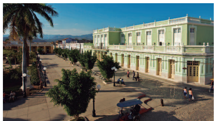
Main Square, Trinidaa

Day 4 Visit Che Guevara's mausoleum on the way to Havana or Varadero beach.