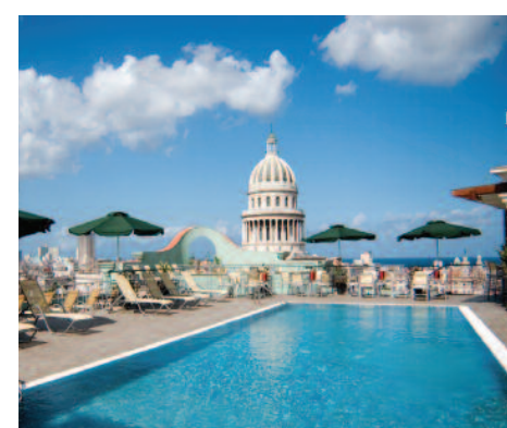
Pool at the Saratoga hotel

An elegant building with a predominance of the neoclassical, located in one of the main streets of Old Havana, in front of a park and with a great view of the Capitol building. It is considered to be the best hotel in Havana. The 96 rooms reflect the elegant proportions with french windows and classic traditional balconies with wonderful ironworks. There is a rooftop pool with a magnificent view of the city, a restaurant and very pleasant bar.